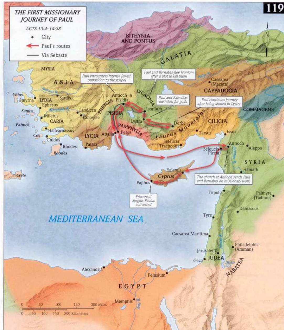
The First Missionary Journey of Paul Acts 13:4 – 14:27

3 Grace be to you and peace from God the Father, and from our Lord Jesus Christ,