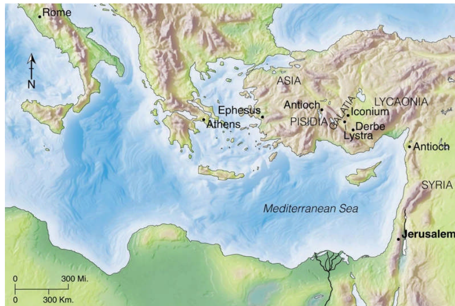
Galatia in Turkey

Paul visited several cities in Galatia on each of his three missionary journeys. On his first journey the apostle went through Antioch in Pisidia, Iconium, Lystra, and Derbe, and then reversed his steps; on his second journey he went by land from Antioch of Syria through the four cities in Galatia; on his third journey he also went through those cities on the main route to Ephesus.