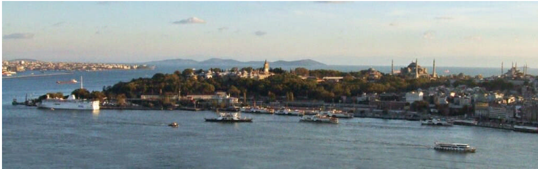
The Golden Horn and Sultanahmet Modern Istanbul, Turkey