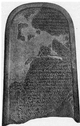
The Moabite Stone Victory Stele of King Mesha of Moab c. 1891

11. During his reign the good king Josiah (641–609 BC) destroyed the cult worship of Chemosh within Judah (2 Kings 23).